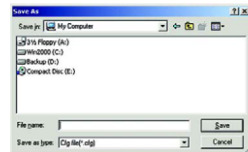
Figure 6-7: Exporting a Profile